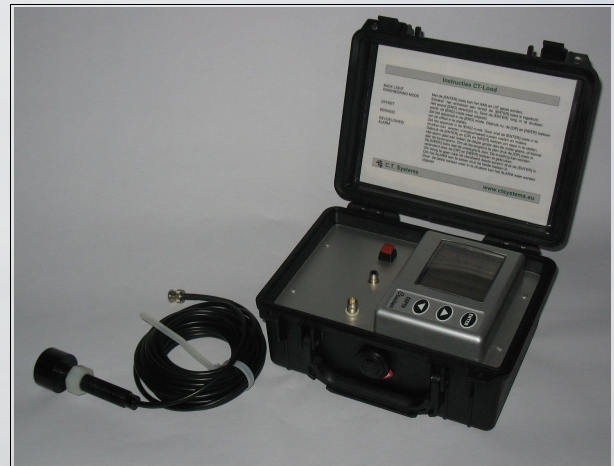
Instructions in the lid